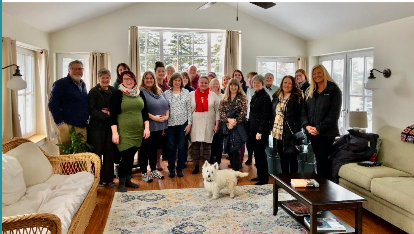
Mission Island Health personnel, island eldercare workers, and guests at a previous Mission Island ElderCare Conference.